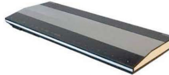
Beomaster 4500 SW 1.x (A.OPT 1.6)